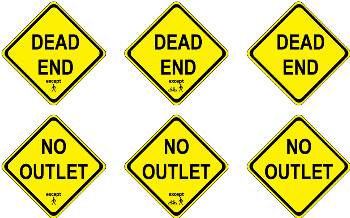
Living-end road (pedestrians)

For the non-Vienna-convention signs, a similar signage could be developed. Although those signs tend to be more text-based than icon-based, initial usability testing revealed positive acceptance and understanding of the proposed combinations of text and icons.