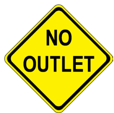
The dead end sign and the alternative “no outlet” sign as used in most countries that do not adhere to the Vienna convention. In the US, they are referred to as W14-1 and W14-2, respectively.

For the information signs, the Vienna convention allows a large flexibility with respect to content. Contrary to prohibitory or mandatory signs, where modifications are rarely allowed, the information signs can be modified by the road authority to reflect the local situation. Additional information in undersigns (such as “except for bicycles and pedestrians”) are discouraged. For the yellow diamond signs, regulations vary by country.