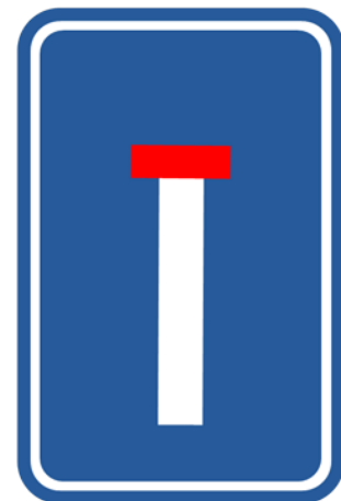
Dead end for all