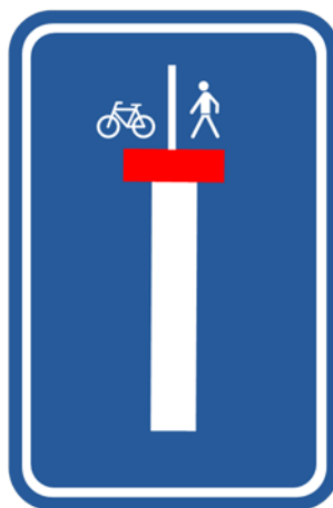
Living-end road (pedestrians and