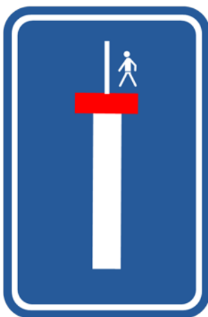
Living-end road (pedestrians)

The International Federation of Pedestrians (IFP) prefers not to change the basic lay-out, but only to provide additional information in a non-cluttering way. The approach would be that the perception of the sign from a distance (important for motorists) would be very similar to the basic dead-end street sign, while closer observers (cyclists and pedestrians) would be informed about their possibilities. Fussverkehr Schweiz, the Swiss Pedestrian Organization, studied 1 alternative signage, evaluating both undersigns and pictograms on the original sign. Road user preferences and readability of different alternatives were tested for the Vienna conference type of signs. The below signage was clearly preferred, and 84% of the respondents rated the additional information as “important” or “meaningful”.