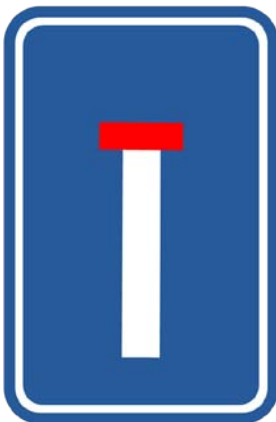
The dead end sign as used in most countries that adhere to the Vienna convention

The classical signs indicating a dead-end road are frequently used in an inappropriate, car-only mode. For living end roads, it is simply incorrect to state that the road is dead-ended. It neglects the existence and the rights of road users other than motorized ones. Often, these routes are the most appropriate for cyclists and pedestrians, while the sign just discourages them to use these itineraries. This is especially the case for people not familiar with the area, but even the local people might totally be misled by this bluntly wrong information.